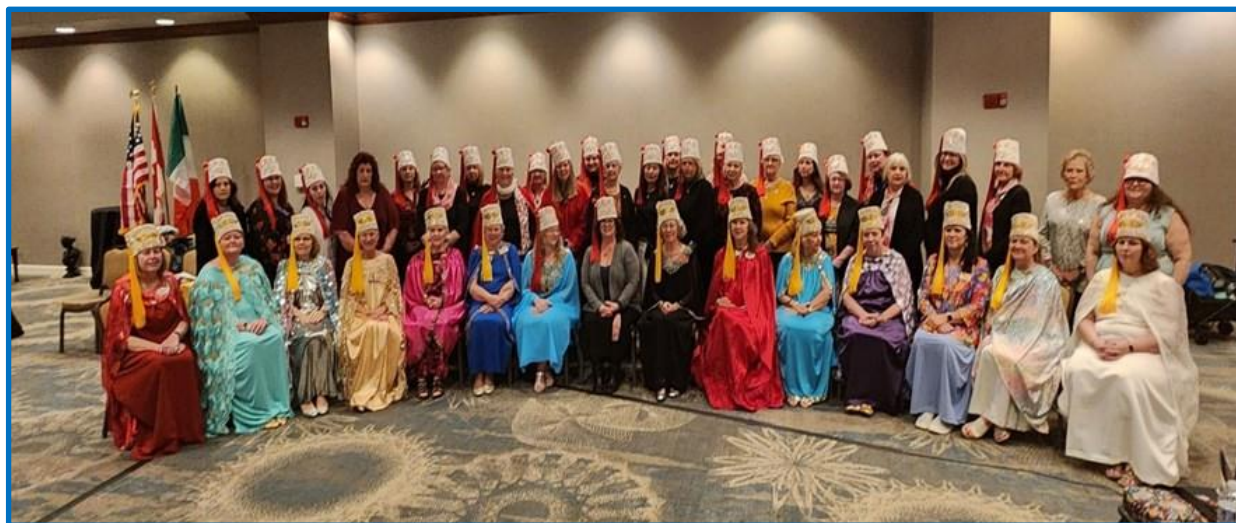
The Grand Officers and Members of Zara Court #113